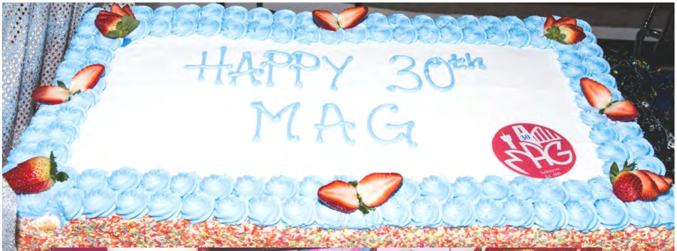
Our beautiful cake