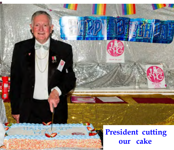
President cutting our cake