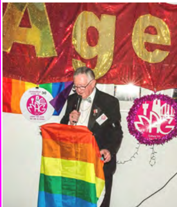
The President speaking