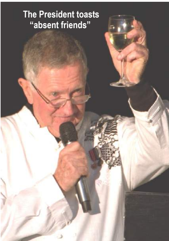
The President toasts "absent friends"