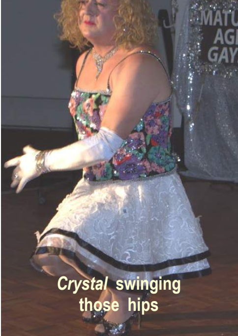
Crystal swinging those hips