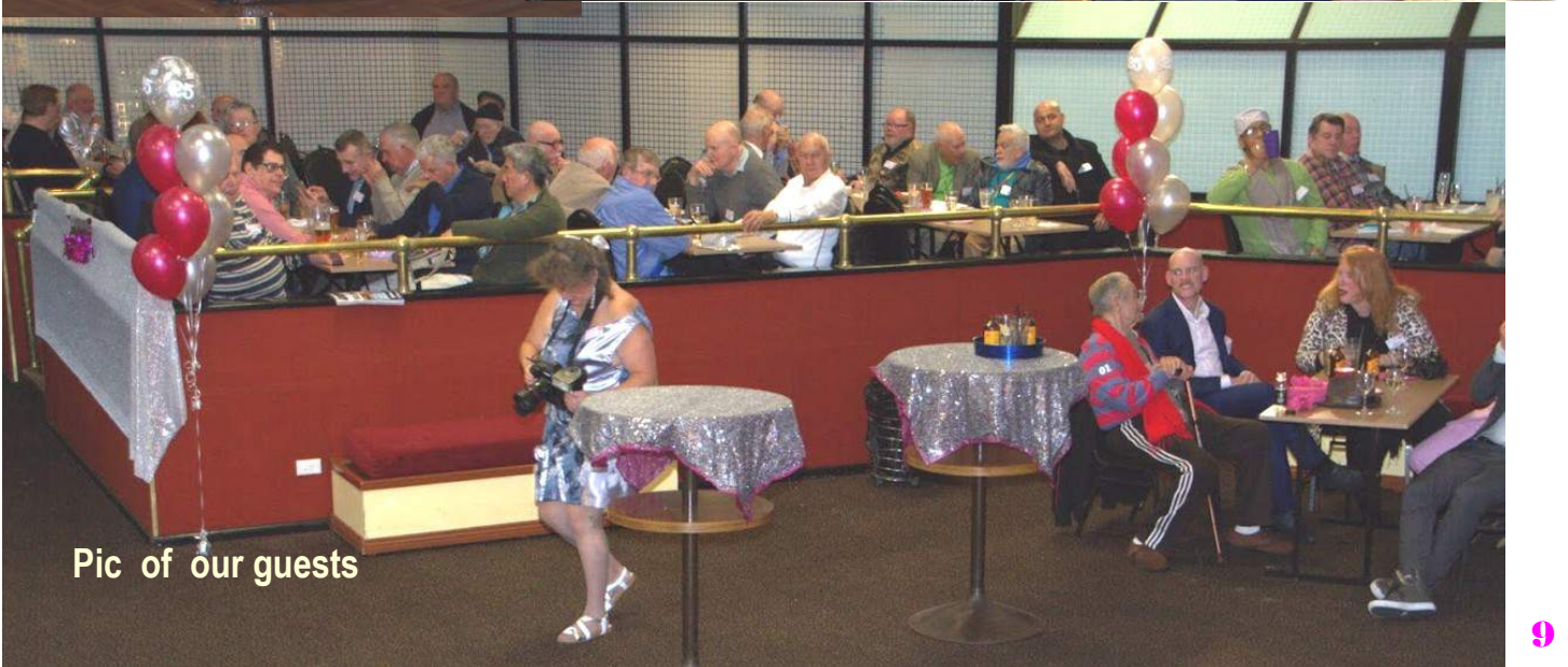
Pic of our guests