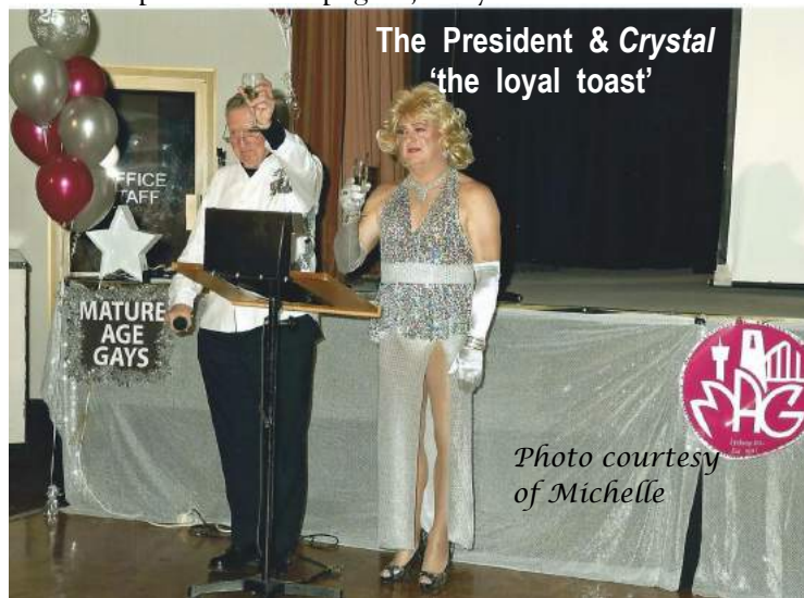
The President & Crystal 'the loyal toast'