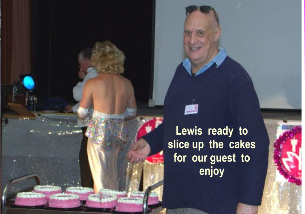
Lewis ready to slice up the cakes for our guest to enjoy