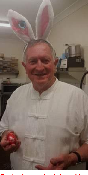
Easter bunny in Asian shirt