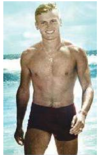
The handsome Tab Hunter

Currently we have 123 Members, which I am very pleased with. I would like to place on record my appreciation to those guys who give a helping hand at meetings and those members who regularly attend our meeting and functions. Naturally, we do have members who are not in a position to do that, but support us in spirit . Thanks everyone!!