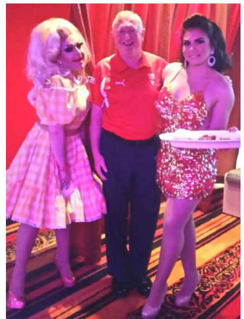
I am with two of the lovely hostesses