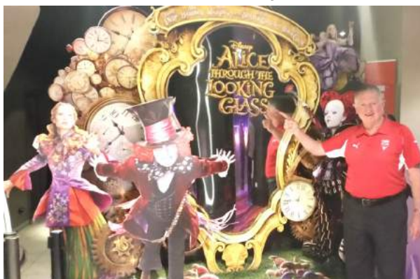
In front of the Looking Glass at the Events Cinema