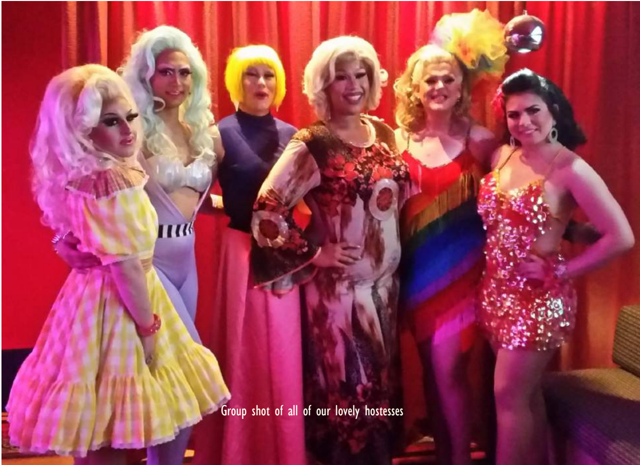
Group shot of all of our lovely hostesses