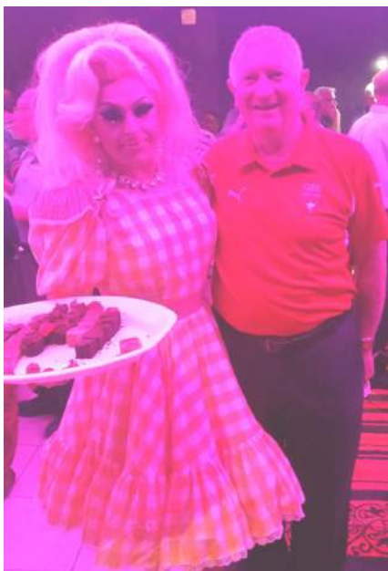
I am with one of the lovely hostesses The overhead pink lighting made a pics taken in a certain area turn out pinkish .

Forewarning members and friends that MAG SYDNEY INC's Annual General Meeting [ our AGM ] will be held on Saturday, 30th July 2016 .