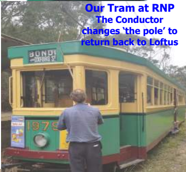
Our Tram at RNP The Conductor changes 'the pole' to return back to Loftus