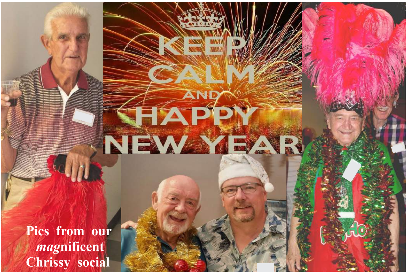
Pics from our magnificent Chrissy social

please check our web site www.magsydney.org