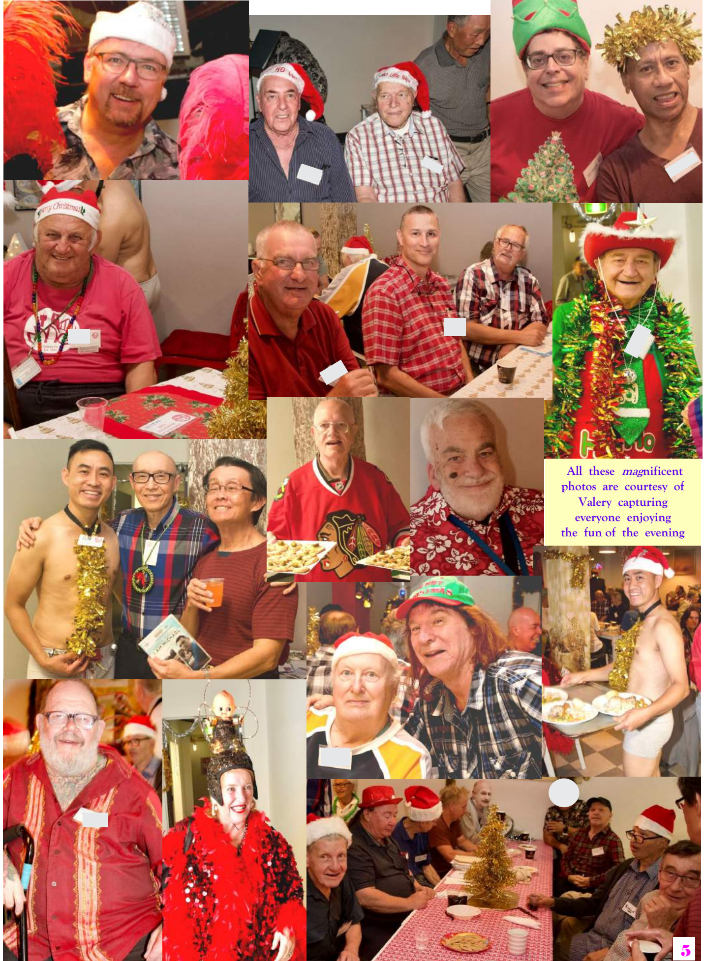
All these magnificent photos are capturing everyone enjoying the fun of the evening