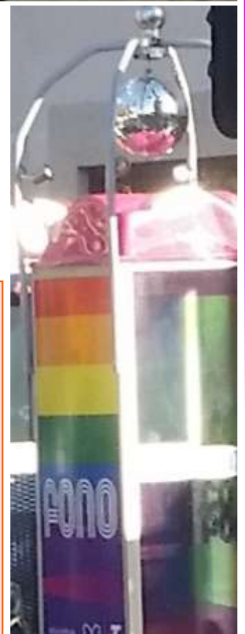
A Telstra Telephone booth in Newtown with a mirror ball & spot lights on top — for Mardi Gras