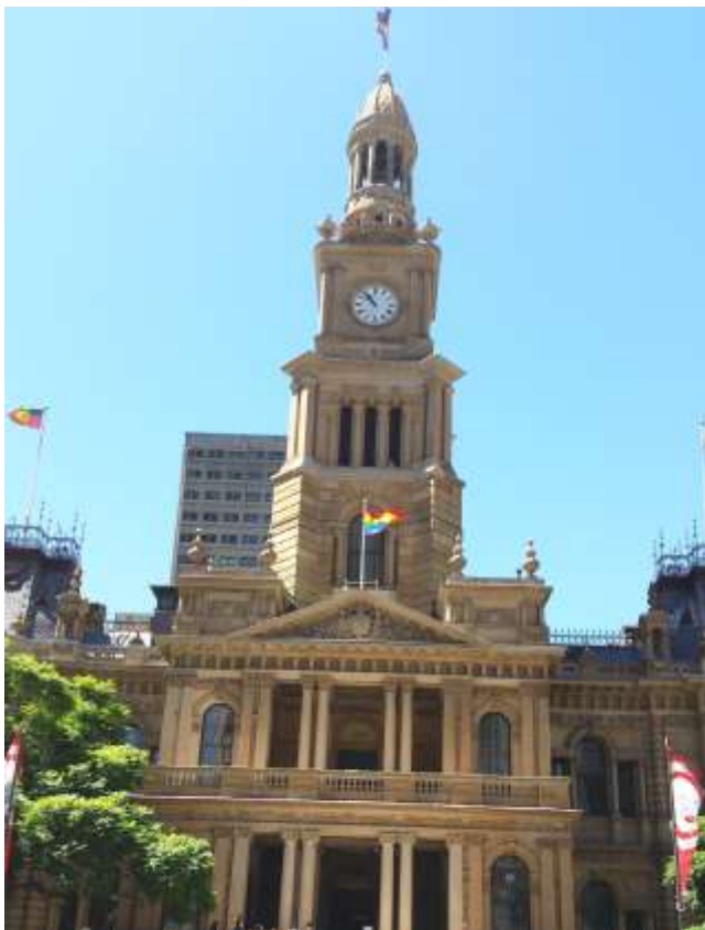
Sydney's Town Hall with the Rainbow Flag proudly flying for Mardi Gras