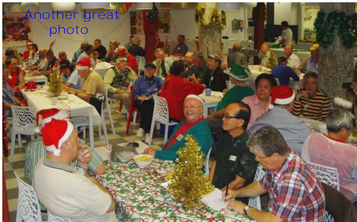
Another great photo